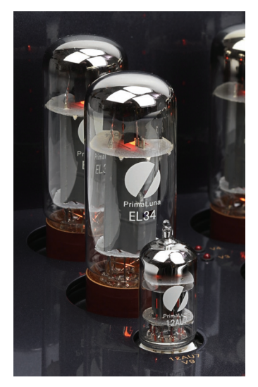
The EL34 power output valves are arranged in push-pull pairs to achieve 80 Watts per channel.

And – oh! – what a glorious sound hit me. It's always great to hear a finely tuned valve amplifier with high quality components, wiring and all that, because you are immediately faced with stunning clarity and wide open sound staging – and that is