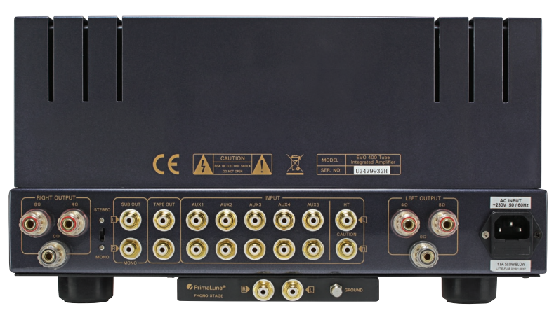
Large, gold plated loudspeaker sockets cater for 8 Ohm and 4 Ohm loudspeakers. A long array of solid, isolated gold plated RCA phono sockets carry inputs and outputs. An MM phono stage option is slung underneath.

valve amplifier comes from its small component count, plus quality of components used – and here the EVO 400 immediately set out its stall, with dramatic ability. Better, it was sublimely sweet and easy on the ear in best analogue fashion – a flowing and smooth sound, like liquid water. This was using Triode mode, slightly easier and purer than Ultralinear.