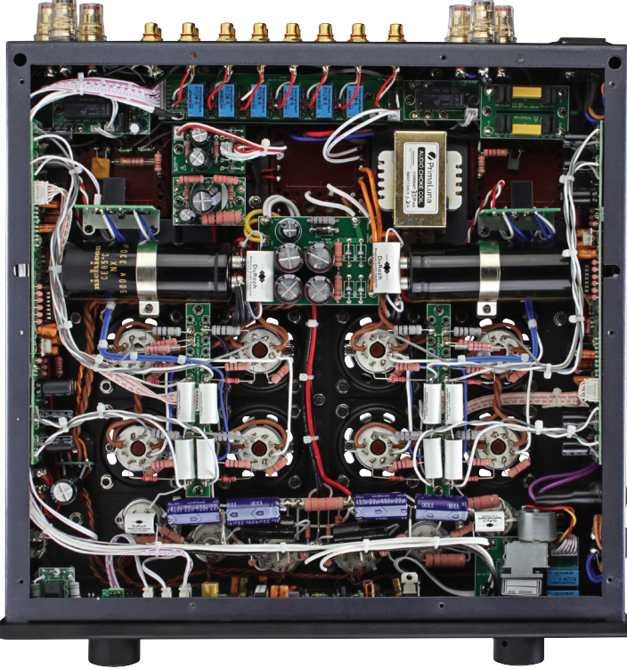
Complex interior, part hard wired, part circuit board. Visible are large black power supply smoothing capacitors (centre), a mini standby transformer (top right) and motorised Alps volume control (bottom right).

often felt best sound quality, but with reduced power quoted as 38 Watts per channel. Volume is altered by an Alps Blue Velvet motorised potentiometer that rotates in ghostly fashion under remote control – a tried and trusted solution. There is also power on/off on a left side-mounted rocker switch. Awkwardly, to load the remote with batteries (two AAA) two rubber bands must be removed and four small Philips head screws undone, but I guess most dealers will do this.