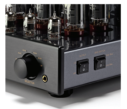
At right lie rocker switches to change bias and switch off output for headphone listening.

PrimaLuna use their own adaptive auto-bias circuitry that allows the amplifier to use a range of output valve types, without need for manual bias adjustment. They quote a